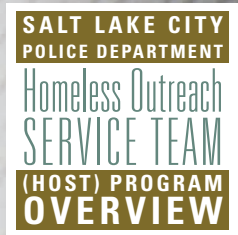
Figure 2a. Resource card front

“Give where it helps, not where it hurts”