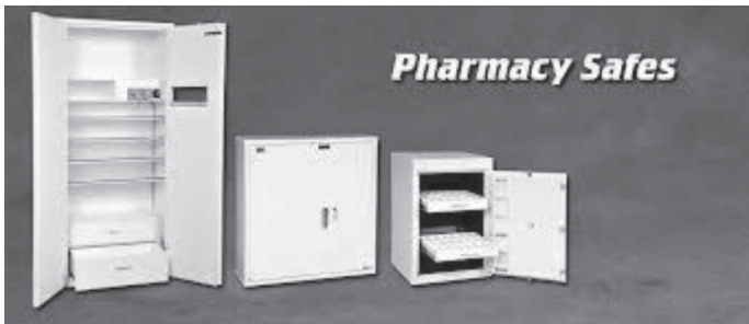
Figure 3: Examples of pharmaceutical safes ( www.amsecusa.com/pharmacy/ )

customers of this practice. The location of the safe can also aid in hardening the target. In the same analysis of RxPATROL data described earlier, it was found that 84 percent of the pharmacies that were burgled had no safe. 18 There are many types of safes; pharmacies should consider burglary-resistant over fire-resistant ones. Burglary-resistant safes have a rating system relating to how difficult and time-consuming breaking into it will be. One example, specially designed for dispensing drugs, is PharmaSafe™ (See figure 3). The only way to open the safe is to process a prescription.