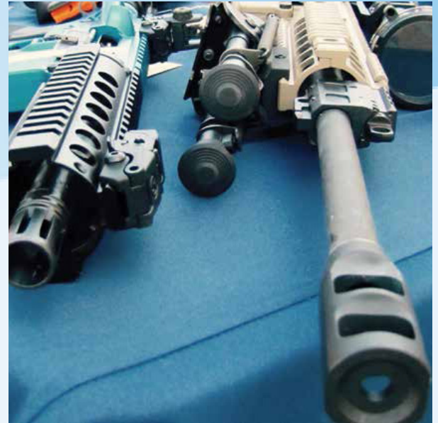
Firearms seized by LASD, ATF, DEA and the FBI.

ATF-Compton Station collaborative activities have been very successful. In July 2016, an ATF-led investigation led to indictments against 9 accused of illegal firearms and narcotic sales in and around Compton and Mona Park in Willowbrook, on the city's northern border. During the course of the year-long investigation, authorities took more than 100 illegally trafficked firearms off the streets. As a result of ATF-