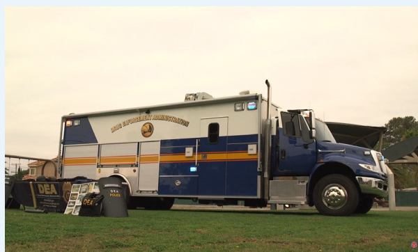
DEA representatives present information on the agency at a community event

One DEA agent and one DEA Task Force Officer (TFO) have been assigned to Compton Station since the beginning of Compton's PSP engagement. Throughout the PSP engagement (September 2015-- August 2018), these two agents have provided over 15,000 hours of labor to PSP-related cases. This work has resulted in 18 arrests (12 federal and 6 state) and the seizure of 370 pounds of methamphetamine, 35 kilograms of cocaine, 8 kilograms of fentanyl, 3 kilograms of heroin, $470,000, and 120 firearms.