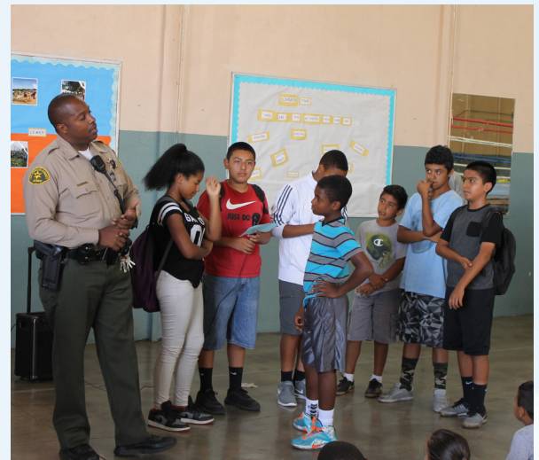
LASD Deputy meets with children during Cops and Kids program.

IDENTIFY APPROPRIATE PARTNERSHIPS: An important step toward successful law enforcement collaboration is identifying appropriate partnerships and determining how they will be valuable. Assessments and capacity analyses are available through PSP to aid sites identifying needs and partnerships. Compton Station engaged in a number of assessments and trainings to identify weaknesses and resource gaps in its policing and better understand the resources available through partnerships. It used that information and those partnerships to fill resource and knowledge gaps.