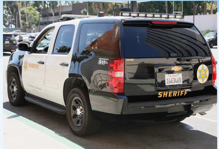
Los Angeles Sheriff's Department Compton Station Vehicle

In September 2015, Compton was selected to be part of the US Department of Justice's (DOJ's) National Public Safety Partnership (PSP). The PSP is a DOJ-wide program that enables cities to consult with and receive coordinated training and technical assistance (and an array of resources) from DOJ to support violence reduction strategies as part of a three-year engagement. The PSP facilitates the development of data-driven, evidence-based strategies tailored to the unique local needs of participating cities to address serious violent crime challenges. Compton was part of the PSP initiative through September 2018.