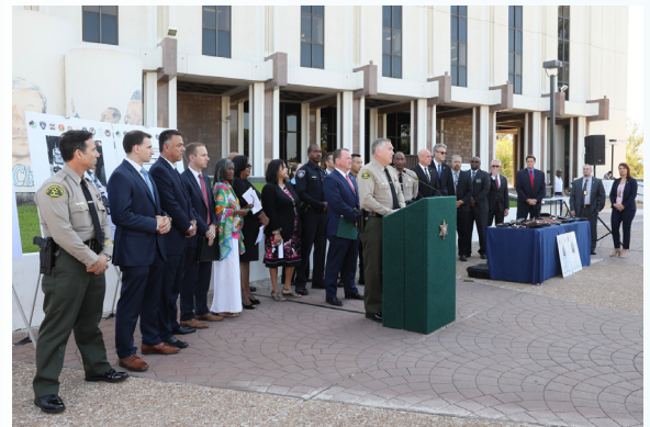
Members of the Compton PSP attend a press conference on September 11, 2018 to discuss the successes of the PSP program.

APPOINT THE RIGHT LEADERSHIP: Once partnerships were identified, the partners worked together to identify the right leaders. The Compton PSP identified appropriate leaders in Compton Station and all federal and local partnerships early on to promote buy-in. They maintained those leadership positions over time to encourage accountability and sustainability of partnership efforts, such as multi-agency task forces. Identifying these leaders and communicating were critical to their success. Compton Station worked with partners to clearly define agreed-upon goals to drive partnership actions.