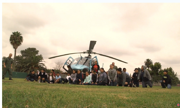
Local youth attend a presentation from the DEA