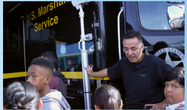
A representative of USMS participates in a presentation to local youth

The Los Angeles County Probation Department joined the Compton Collaboration to assist with targeting high-risk repeat offenders. At any