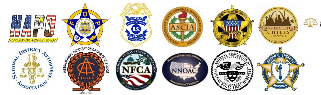
July 6, 2015

The Honorable Kevin Yoder Third District, Kansas United States House of Representatives 214 Cannon House Office Building Washington, DC 20515