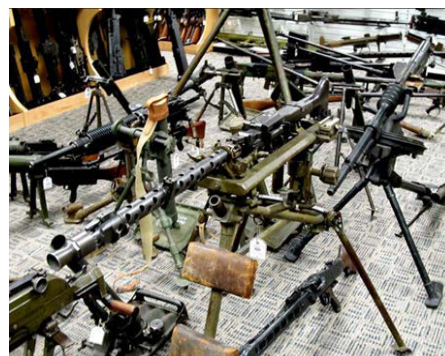
Part of ATF’s reference library

containing over two thousand publications, technical reference files on firearms, specialized testing equipment, specialized gunsmithing tools, and a test-firing facility.