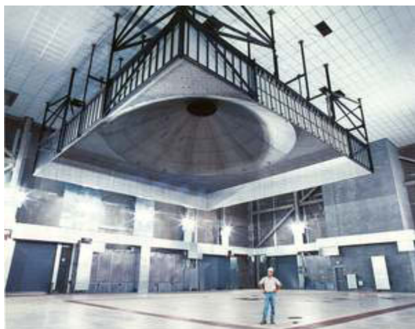
ATF's Research Laboratory

ATF's Fire Research Laboratory opened in 2003. It is the world's only large-scale research laboratory dedicated to fire-scene investigations. FRL scientists use its unique structure and sophisticated instrumentation to investigate fire-scene phenomena, conduct forensic fire science and engineering tests, and analyze fire growth and dynamics questions.