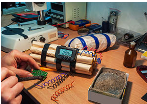
Demonstration of technical explosive capabilities

An ATF EEO has unique technical capabilities in explosives and bomb disposal. EEOs render bombs and other destructive devices safe, conduct advanced disassembly procedures in order to preserve and exploit evidence, provide explosive device determinations for criminal prosecutions, and routinely conduct explosives threat assessments of vulnerable buildings, airports, and national monuments. EEOs assist ATF special agents, CESs, and local, state, and other federal law enforcement agencies in explosives-related investigations and provide expert courtroom testimony in support of these investigations. EEOs are ATF's primary point of technical assistance and support in matters involving IEDs and destructive devices. Their duties range from conducting explosive product testing and evaluation to assisting the Department of State's Antiterrorism Assistance Program in conducting antiterrorism capability assessments outside the United States. Many EEOs previously