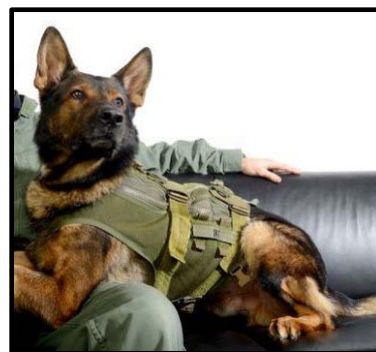
Ike, a tactical canine, can detect explosives.

One tactical canine (Ike, pictured right) is also trained and certified in explosives detection.