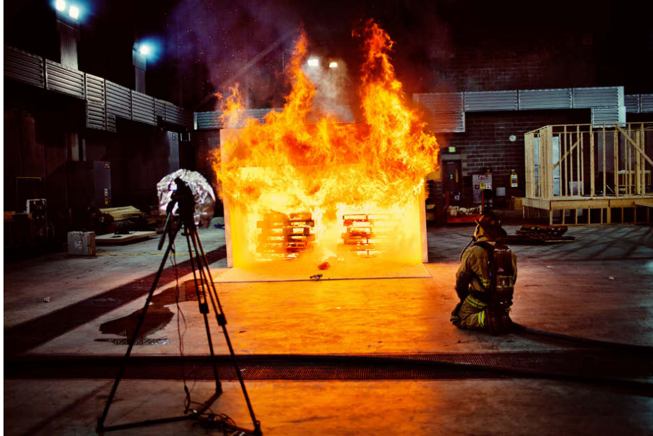
A demonstration cell burns to test a newer, thinner drywall at the ATF Fire Research Laboratory.

As the premier fire science research facility, the FRL serves as a national and international model for forensic fire research and for the development of research protocols. The laboratory is an internationally recognized research and education center for fire cause investigations and fire scene reconstructions. The American Society of Crime Lab Directors—Laboratory Accreditation Board has accredited the FRL to conduct investigations related to fire scene reconstructions.