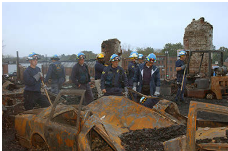
ATF's National Response Team (NRT)

Formed in February 1978, the NRT investigates significant fire and explosion incidents. Federal, state, and local investigators can request the activation of the NRT, and the International Response Team, part of the NRT program, can be deployed worldwide to investigate fires and explosions at the request of the U.S. Department of State.