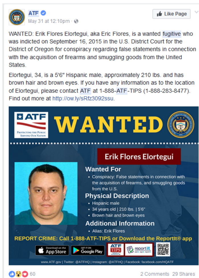
Example of an ATF Facebook posting for a wanted fugitive

Social media is a terrific tool for law enforcement. In addition to typical investigative uses, ATF takes advantage of Facebook's broad reach to notify the public of its hunt for fugitives. ATF posts fugitive notices to its page and can target dissemination of the notice to users based on location and age. If a prosecutor would like violent fugitive information posted, the prosecutor can ask an ATF agent directly or contact the ATF public information officer in the closest field division. The ATF website also lists fugitives and allows searches by location. 86