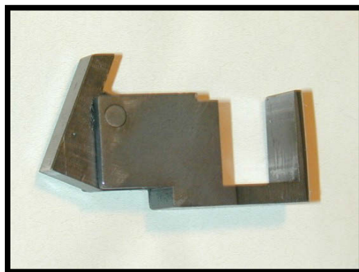
Example of a part that converts a semiautomatic firearm into a machinegun.

Certain violations of the GCA, including 18 U.S.C. § 922(g), require a nexus to interstate commerce. 77 Approximately three hundred ATF special agents are nexus examiners with the responsibility of providing an interstate nexus determination and report for firearms and ammunition. Examiners have completed basic and advanced training courses and have made factory visits to many firearms and ammunition manufacturers. ATF examiners often testify in court as expert witnesses.